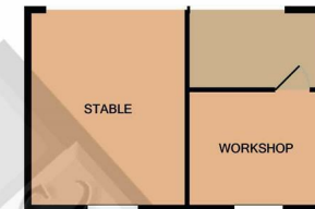
STABLE & WORKSHOP